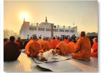
Special Sunrise Ceremony

THE HIMALAYAN VEGAN FESTIVAL will be a CARBON NEUTRAL EVENT: All the Himalayan Vegan Festival events will be 100% carbon neutral. All carbon emissions will be offset with community tree planting and other offset projects that volunteers are organizing with youth from Pokhara, Lumbini, and Kathmandu, and we'll be using Yeti Airlines, Nepal's first carbon-neutral airline, for all our roundtrip flights from Kathmandu to Pokhara, and Kathmandu to Lumbini. The Lumbini Development Trust has brand new electric buses they are providing us for our transfers during the 2-day event in Lumbini as well.