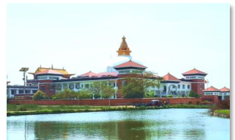
Lumbini Festival Venue – World Peace & Unity Center