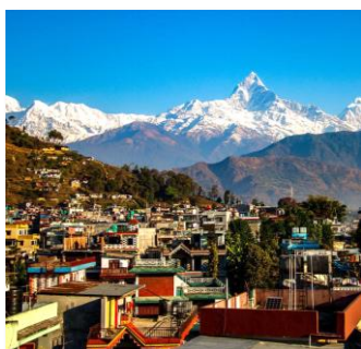
Pokhara city with Himalayan views

This history-making event will be held in the Himalayan capital of Kathmandu, Nepal, for 3 days from September 15-17, 2022, and in Pokhara, Nepal for 3 days from September 18-20, 2022. Pokhara is the country's second-largest district and a very popular domestic ( as well as international ) tourist area that is home to spectacular Himalayan views, Nepal's 2nd largest lake ( it is famous as the city of lakes ), and colleges. The Gandaki Province government has personally invited the festival to come there & the National Tourism Board is going to organize a full vegan street food fare festival in the evening on the country's Constitution Day on September 19 th where even two members are involved in drafting the Constitution will join us. We'll have a 2 day-event vegan celebration with workshops, talks, screenings, cultural programs, lots of fantastic vegan food, and a fantastic vegan food festival night market on Constitution Day, and on the third day after having a delicious vegan buffet breakfast as the sunrises over the Himalayas on a nearby mountaintop ( which we'll access by the country's newest cable car built as a Japanese-Austrian-Nepal collaboration ) with some of the best Himalayan views in the area, we'll join members from the local community as they share with us their community and culture in Pokhara.