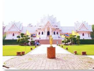
Royal Thai Monastery