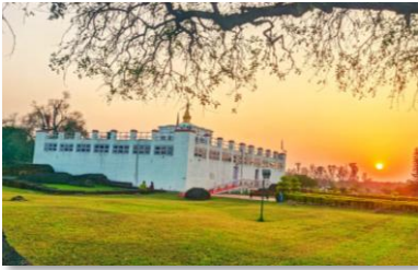
Birthplace of Buddha, Lumbini