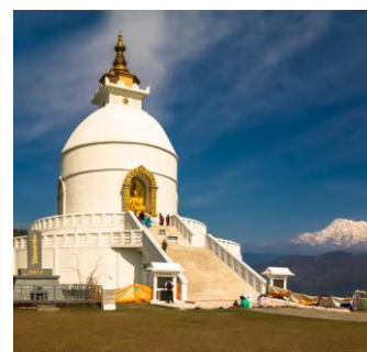
World Peace Pagoda (Stupa) Pokhara

We also cordially invite you to join us a couple of days before The Himalayan Vegan Festival for a 2-day pre-festival event in Lumbini, the birthplace of Buddha. We will be hosting a pre-festival event on Climate Change, Conservation, a Plant-Based Diet, and Buddhism in the 21st Century . This gathering of environmentalists, vegans, monks from all the different countries' monasteries represented at Lumbini, community leaders, and students, will be an awareness event about climate change, conservation, and a plant-based diet, and their relevance to Buddhism in the 21st century. It will be held at the Nepal World Center for Peace & Unity Monastery ( Mahayana Buddhism ), and we'll be having fantastic vegan temple food which is being hosted at the Thai Monastery ( Theravada Buddhism ). We'll also be having a completely vegan ceremony at the Maya Devi Temple ( location of the Buddha's birth ) where the traditionally fueled butter for the lamps will be replaced with vegetable oil, the food offerings to the monks will all be vegan, & even any drums accompanying the ceremony will also be vegan ( no animal skin ). This will be the first time the ceremony is performed completely vegan.