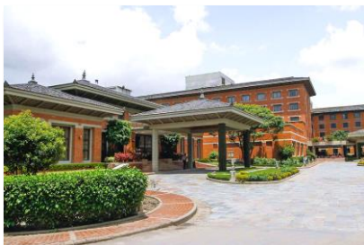
Kathmandu Festival Venue – Soaltee Hotel

WE LOVE OUR SPONSORS AND LOOK FORWARD TO PARTNERING WITH YOU! Sponsors get recognition before, during, and after the festival through a variety of mediums and media. These include sponsors being promoted in our souvenir programs that will be given to each attendee at the festival; prominent recognition on our website; shout outs and promotions at the event & on our social media channels; direct advertising at the festival; your company's samples or advertisement coupons in our swag bags; and opportunities to promote your company and your products to the many local and regional media and press who will be attending the festival. In addition, we are also very happy to provide sponsors a complimentary exhibitor's table at the festival where you'll have the opportunity to showcase your products, services, and causes to families, college students, and young adults, as a concerned and progressive company and organization that is thoughtful of helping people, animals, and the planet. It's a great way to get your message out to a receptive, and engaging audience. The Himalayan Vegan Festival will be hosting over 100 exhibitors, and 100+ international delegates and speakers. We will be welcoming thousands of attendees to discover, celebrate, and support a compassionate, plant-based lifestyle in the heart of the Himalayas! Our sponsors get all the above exposure not only at one of the 3 events, but at all 3 events of The Himalayan Vegan Festival – in Kathmandu, Pokhara, and Lumbini!