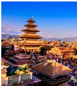
View of the old city of Kathmandu

The Himalayan Vegan Festival will be FREE and open to the general public and include everyone from local, regional, and international vegan and animal rights activists, and people interested in a vegan lifestyle, to local families, students, and civil servants, community, religious, and political leaders. This non-profit event will focus on raising awareness about veganism and fostering the growth of the vegan lifestyle and movement through a range of activities. The Himalayan Vegan Festival includes informative talks and lectures; in-depth workshops and demos with speakers coming from all over the region, Asia, and around the world to share ideas. It seeks to inspire local activists, and grassroots vegan movements; provide networking opportunities; raise awareness of the benefits of a plant-based diet to omnivores; and much more. It also provides excellent opportunities for brands and companies to showcase their plant-based vegan products and services. We would be thrilled if you could join us in making history and be a part of this vegan change happening in the Himalayas!