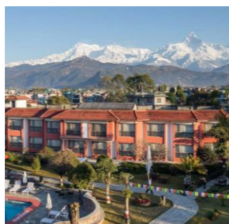
Festival Venue in Pokhara