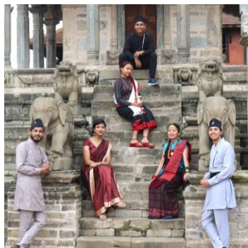
Festival Youth Team Members