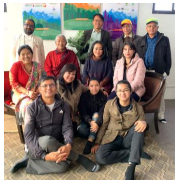
Festival Organizing Committee