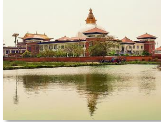
World Center for Peace & Unity.