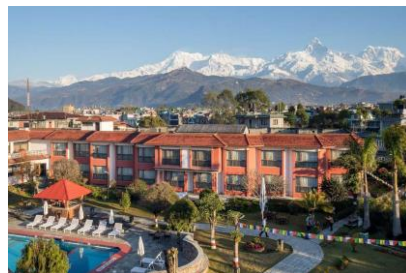
Pokhara Festival Venue – Pokhara Grande