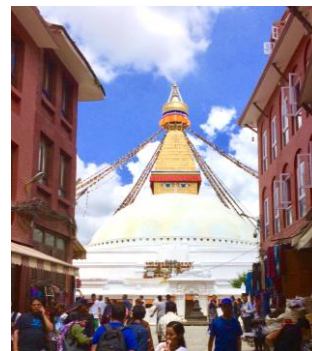
Boudhanath Stupa, Kathmandu

This history-making event will be held in the Himalayan capital of Kathmandu, Nepal, for 3 days from September 15-17, 2022, and in Pokhara, Nepal for 3 days from September 18-20, 2022. Pokhara is the country's second-largest district and a very popular domestic ( as well as international ) tourist area that is home to spectacular Himalayan views, Nepal's 2nd largest lake ( it is famous as the city of lakes ), and colleges. The Gandaki Province government has personally invited the festival to come there & the National Tourism Board is going to organize a full vegan street food fare festival in the evening on the country's Constitution Day on September 19 th where even two members are involved in drafting the Constitution will join us. We'll have a 2 day-event vegan celebration with workshops, talks, screenings, cultural programs, lots of fantastic vegan food, and a fantastic vegan food festival night market on Constitution Day, and on the third day after having a delicious vegan buffet breakfast as the sunrises over the Himalayas on a nearby mountaintop ( which we'll access by the country's newest cable car built as a Japanese-Austrian-Nepal collaboration ) with some of the best Himalayan views in the area, we'll join members from the local community as they share with us their community and culture in Pokhara.